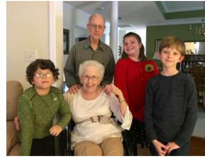
Christmas Caroling---what fun!!